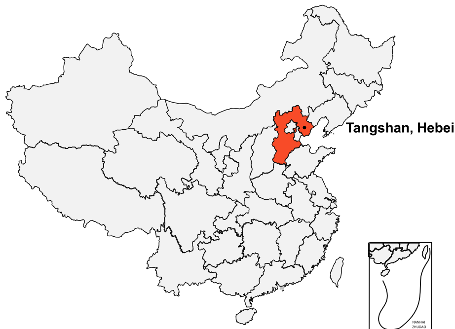
Fig. 1 The geographical location of participants in JECS

The study was performed in the Jidong community of Tangshan city in Hebei province. The location of the study is illustrated in Fig. 1. The study complied with